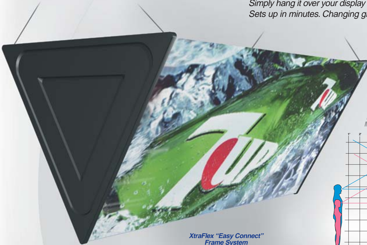
XtraFlex "Easy Connect" Frame System

Don't be shy with your brand or message. The EZ View system takes advantage of a customer's natural sight lines. No more straining or craning for your brand to be seen. Best of all, the EZ View requires no floor space! Simply hang it over your display or aisle for best results. Sets up in minutes. Changing graphics is easy.